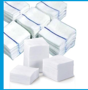
OT.Gauze Swab RO / Non RO