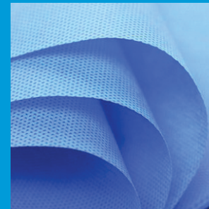
SMMS Sheet Sterilization Wraps